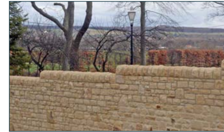
Walling Various types - see separate brochure. Sold by the m 2 . Delivered in tonne bags (4m 2 ) Photo: Cottage