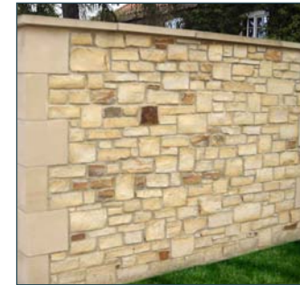
Walling Various types - see separate brochure. Sold by the m 2 . Delivered in tonne bags (4m 2 )