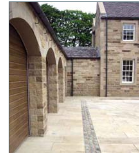
Catcastle Buff Paving Available in a wide range of sizes and different types of stone.