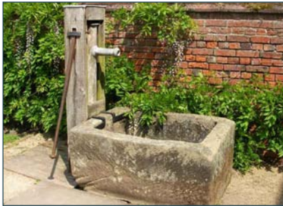
Troughs Available in a wide range of sizes. Second Hand