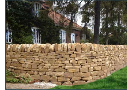
Dry Stone Walling Baxton Law or Dead Friars. Sold by the tonne. Delivered loose in a tipper. Coverage - approx 1m 2 /tonne Photo: Baxton Law