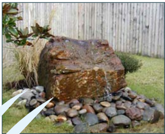
Feature Stone Available in a wide range of sizes and different types of stone.