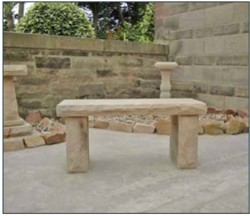
Seats Available in a wide range of sizes and different types of stone.