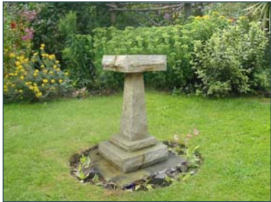
Bird Baths Available in a wide range of sizes and different types of stone.