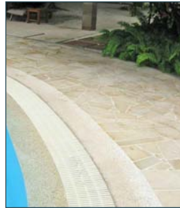
Crazy Paving Sold by the m 2 Random sizes Thickness 20-40mm