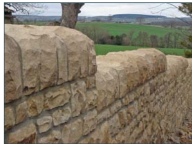
Round Coping Can be made to any size. Delivered on a pallet, shrink wrapped.