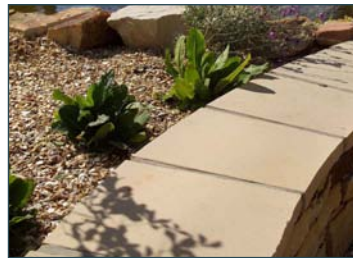
Flat Coping Can be made to any size. Delivered on a pallet, shrink wrapped.